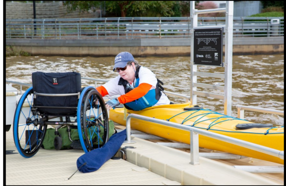
Thank you to Venue Sponsor: